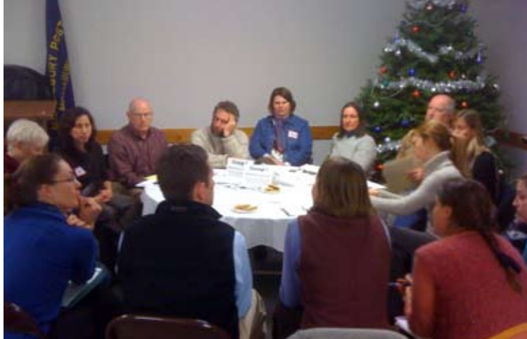
Break-out group at the Addison Food Summit

The VSJF would like to thank the following organizations for helping to organize and host the 8 Local Food Summits that took place between November 10, 2009 and January 15, 2010, including: